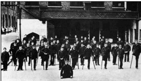
Evidence of crippled factory workers

Edward Baines wrote this in his book The History of the Cotton Manufacture (1835) where he tried to promote the benefits of using child labour in the cotton factories. He owned a cotton factory and opposed the factory laws that tried to stop children from working. He campaigned for child labour. It is no wonder he denied that factory work caused deformities in children. Children were expected to work just as long as men for a cheaper wage! There is a lot of evidence that factory work caused deformities in children as shown in the photo below: