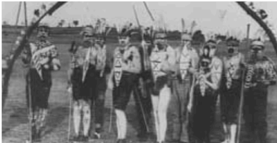
Aboriginal people from Queensland took part in the New South Wales Commonwealth celebrations in January 1901. The landing of Captain Cook in Botany Bay was re-enacted.