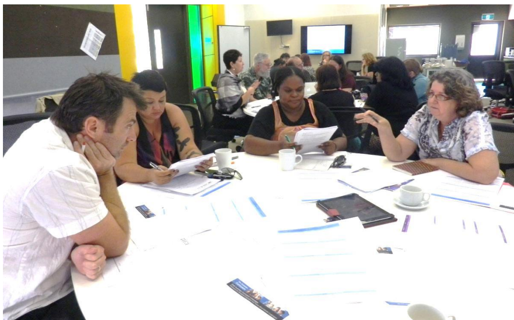
Darwin consultation forum