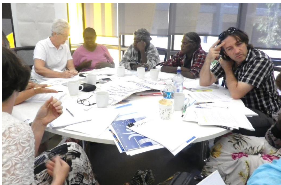
Darwin consultation forum

Some suggested that a stronger statement should be included within the principles and protocols about who should teach Aboriginal and Torres Strait Islander languages.