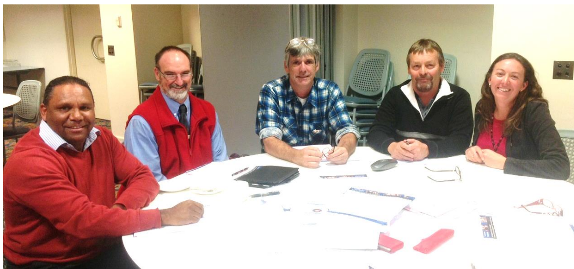
Parkes Consultation forum

There was a view that the current content descriptions focus heavily on learning about culture and language rather than using language.