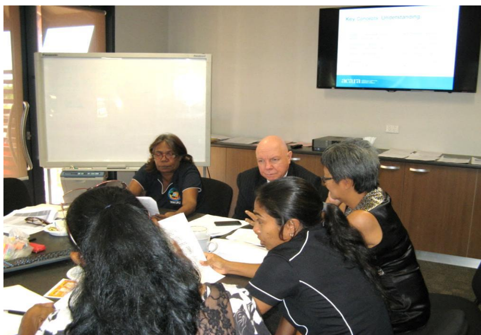
Broome consultation forum Public Consultation