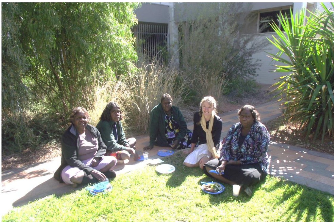
Alice Springs consultation forum