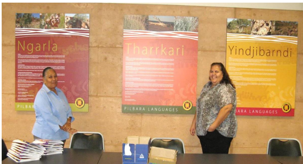
South Hedland consultation forum

Some concerns were raised in relation to the Language Revival Learner Pathway. Participants noted that this pathway needs to cater for a broad range of languages in various states, and for a broad range of learners and contexts. Concern was raised, particularly in the Northern Territory and Western Australia, as to where a language 'which is currently being revitalised' would best fit within the Framework. It was noted that in these situations the languages often have full linguistic codes available, with the issues being that the languages are no longer being transmitted across generations and the number of speakers is diminishing.