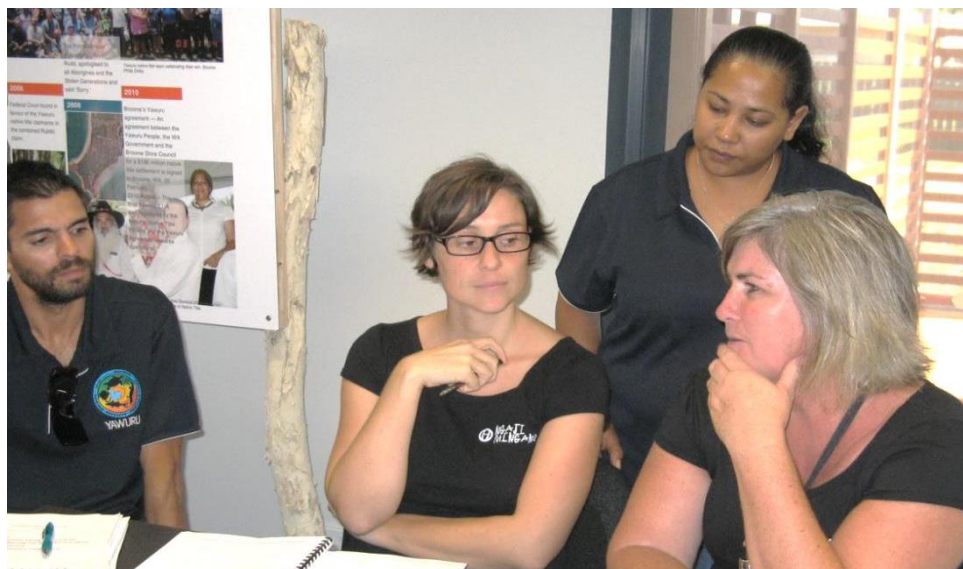
Broome consultation forum

The diagram is good...but we need to put the word Language in it, because that's what it is all about.