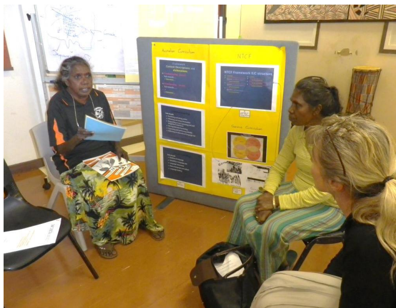
Yirkalla consultation forum

Yaka ŋanapurrunha yurru ganaŋdhunma beŋuruyi yaluŋura. Danapurru djäl ŋanapurru ŋunhiliyi yaluŋura.